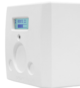
WPTOUCH With surface-mount installation box (included)