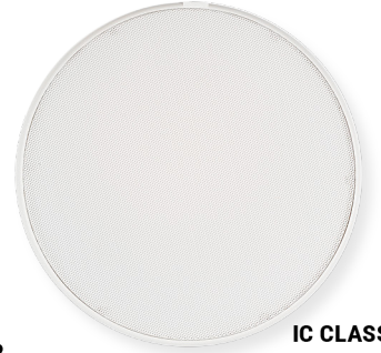
IC CLASS Series grid