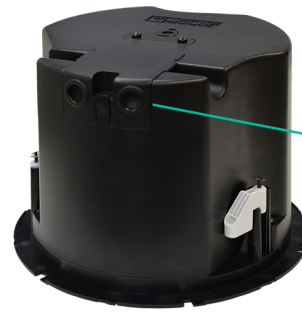
IC6CLASS-54 Back can